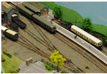
CHRILVINTON ROAD – GWR BRANCH LAYOUT