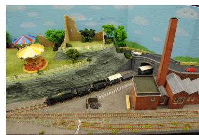
Local Goods arrives