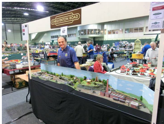
Overall Layout at Shoeburyness Model Railway Show

Exhibition Information is attached and is in 4 sizes depending on your space available so please feel free to use as required. The word count for the text is 70, 140, 250 and 550 words.