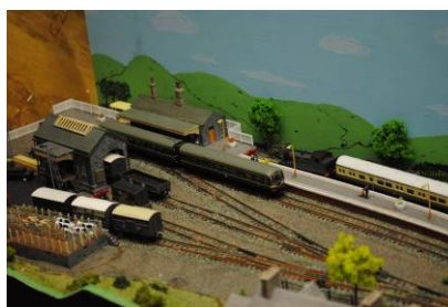
Local DMU waits